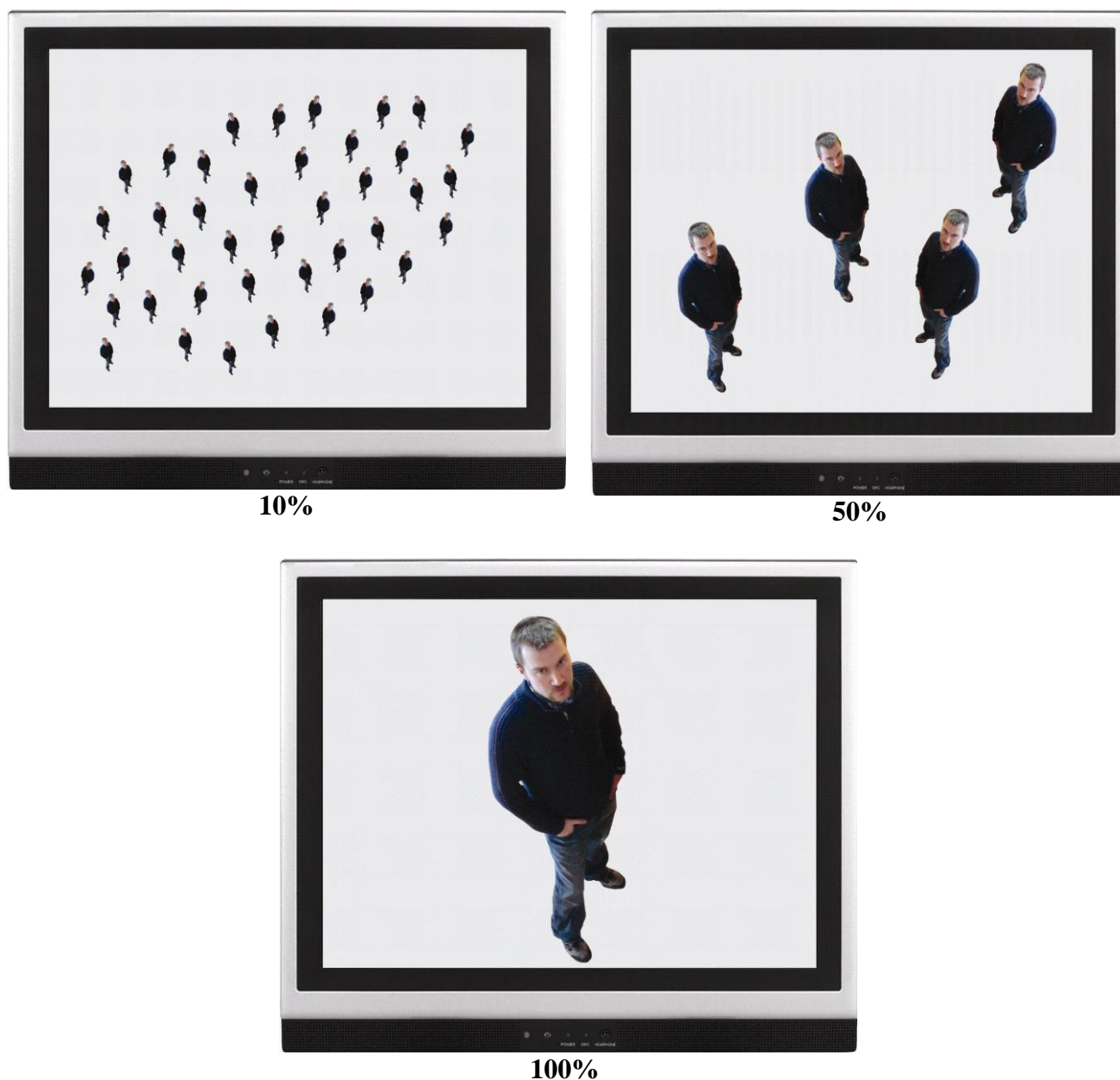
Figure 1 - Graphic Example of Clause 6.2 requirements

Where digital CCTV technology is used and the intended target is a person or persons the equivalent level of quality shall apply.